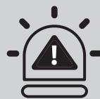
Threat Prevention System